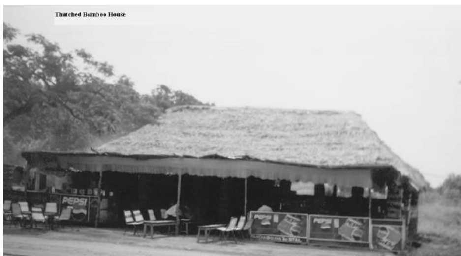
Figure 3. Thatched bamboo house.

In older days bamboo houses were predominant in the housing sector in the study areas. Based on information gathered from elderly people in several places in the study areas using PRA, 90% of houses in the highland areas and 70% in the mid- and lowland areas were partly or fully made of bamboos about 30 years back, but its number has declined significantly. In Kerala, the total number of bamboo thatched and bamboo tiled houses were estimated as 9277 and 807, respectively, and the total demand for bamboo for new construction and maintenance was estimated as 9100 tonnes annually [3]. No such information is available from Karnataka. The decline of bamboo houses in the study areas may be due to a variety of reasons of which the most important, in the initial period, was availability of timber (there was