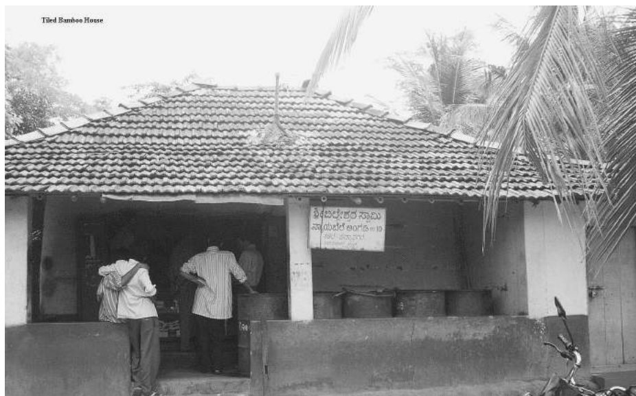
Figure 2. Tiled bamboo house.

In both the types of houses, bamboos are invariably used for making the roof structure. In certain houses, especially thatched one, in addition to roof, bamboos are used for making walls, windows, doors and partitioning. In Kerala, the average plinth area of a thatched bamboo house was worked out to be 40 m 2 and plinth area per person was 8 m 2 , while in Karnataka, they are 31 m 2 and 7 m 2 , respectively. However, the plinth area (45 m 2 ) of a thatched bamboo house in high land was slightly higher than that of an average thatched house. This is mainly due to the fact that availability of bamboo at a low price is more in high land areas in both the states. Further, the thatched bamboo houses in both the states are found to be smaller than tiled ones. For instance, in Kerala, the average plinth area of the tiled house is 58 m 2 and plinth area per person is 14 m 2 . The corresponding figures in Karnataka are 62 m 2 and 13 m 2 , respectively. The average plinth area of a tiled bamboo house in Karnataka varies between 82 m 2 in high land areas and 51 m 2 in low land areas.