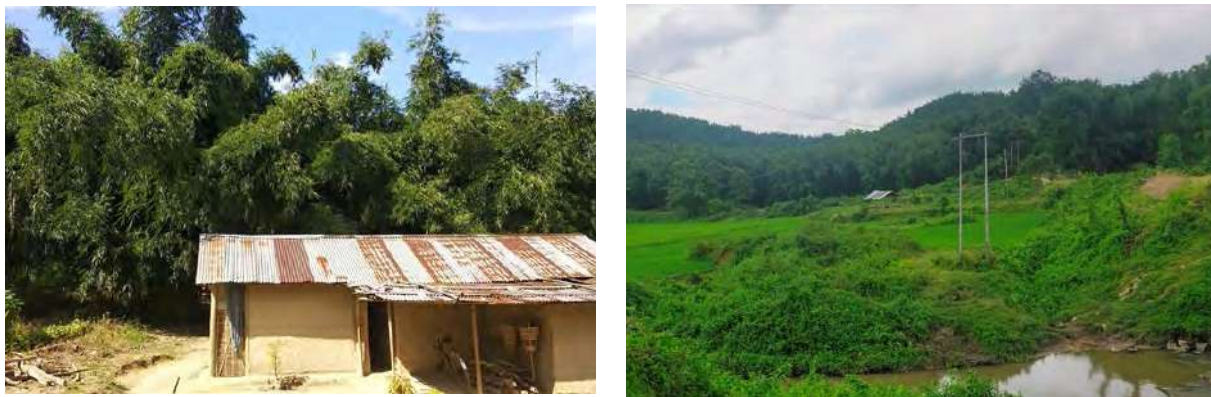
Fig 1. A view of the study area