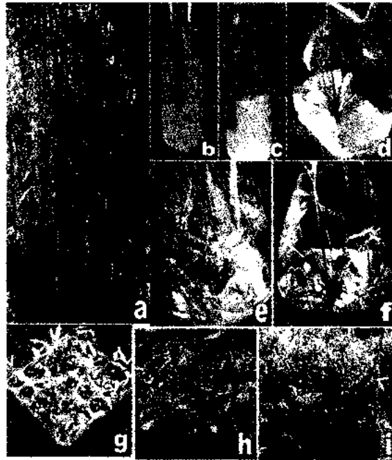
Figure 1. Micropropagation and hardening of B. nutans plantlets. a: mother clump; b: inoculation of explants on MS semi-solid medium supplemented with 10\mu\text{M} BA + 0.1\mu\text{M} IAA; c: bud break; d: excision and transfer of sprouted axillary buds on MS liquid medium + 10\mu\text{M} BA + 0.1\mu\text{M} IAA; e: shoot multiplication on MS liquid medium + 31.06\mu\text{M} BA + 2.85\mu\text{M} IAA; f: rooting on MS liquid medium + 25\mu\text{M} IBA after nine weeks; g: transfer of plantlets of root trainers; h: shadehouse acclimatized plantlets in polybags; i: plantlets after six months growth in polybags.