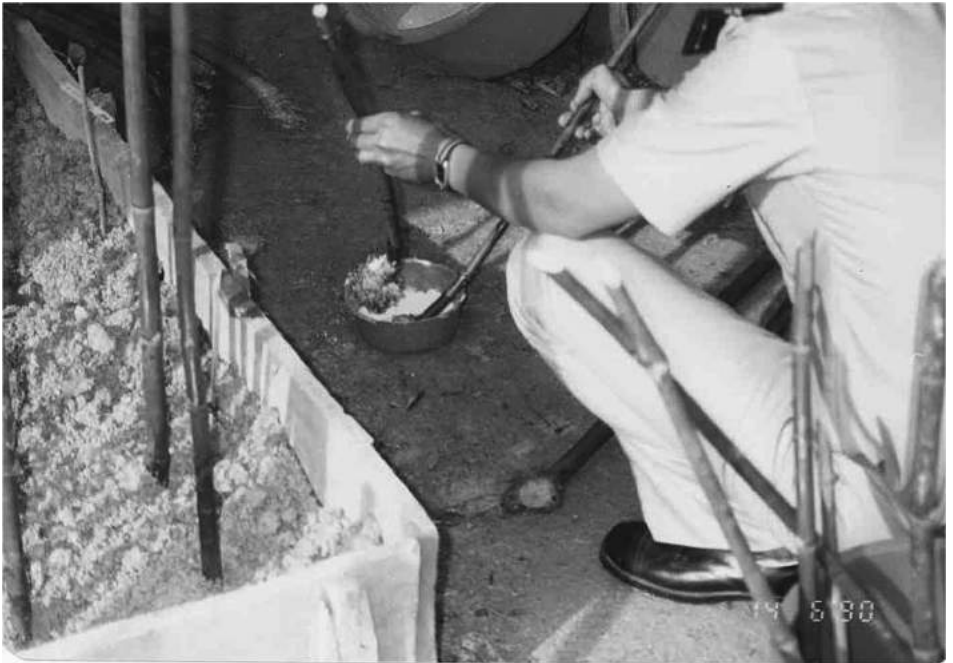
Figure 4. Commercial IBA applied directly.