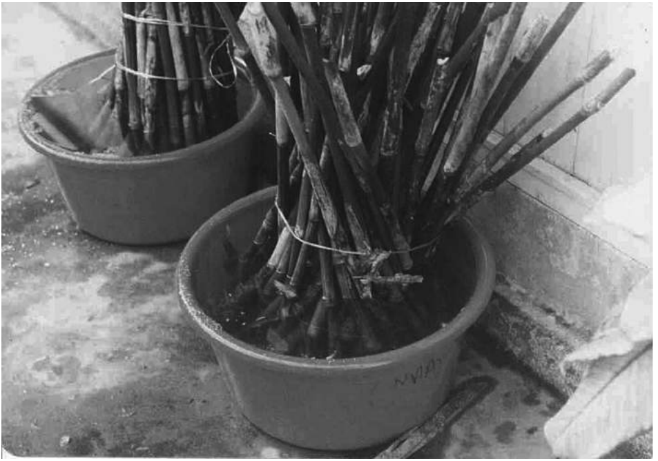
Figure 3. Cuttings soaked in IBA.