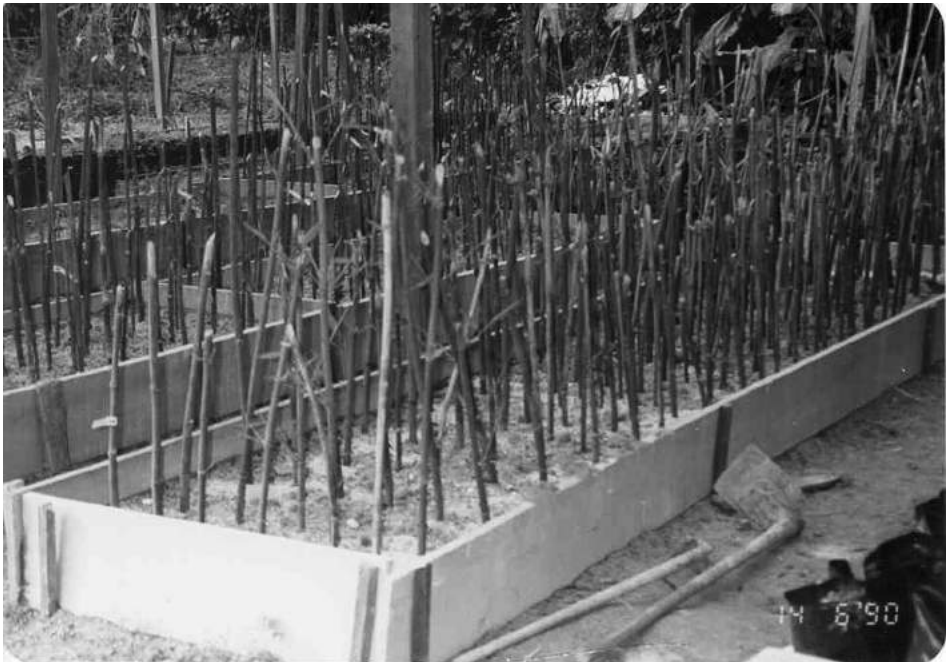
Figure 1. Branch cuttings planted in nursery beds.

To prepare the 100, 200, 300 and 400 ppm IBA solutions, ethyl alcohol was used to dilute 0.1, 0.2, 0.3 and 0.5 g concentrated IBA and then 1000 ml of distilled water was added. The branch cuttings are soaked in the different concentration IBA solutions prepared for 24 h before being planted in the nursery (Fig. 3). The two commercial IBA rooting hormones (Seradix 2 and IBA 2000 powder) were directly applied to the cuttings before planting in the nursery (Fig. 4). In the nursery, the