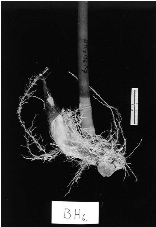
Figure 7. IBA 2000 powder.

The advantage and successful of using polybag branch cuttings planting material is that the cuttings had a established and intact rooting system with minimum root injuries during transporting and planting activities compared with bare rooted and fresh cutting. These findings have also been reported for other seedlings [7, 8].