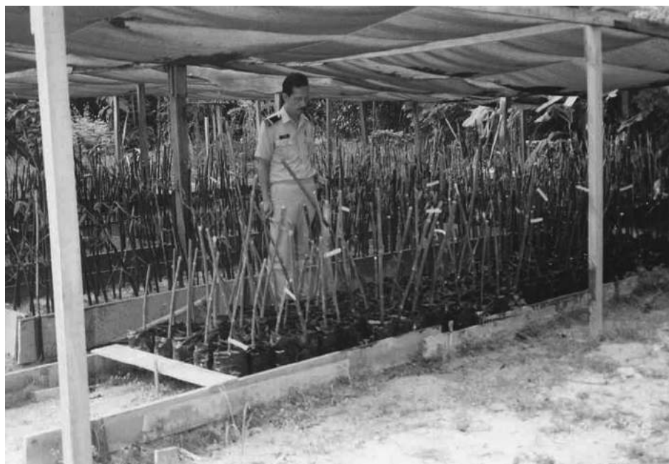
Figure 2. Cuttings planted in polybag.