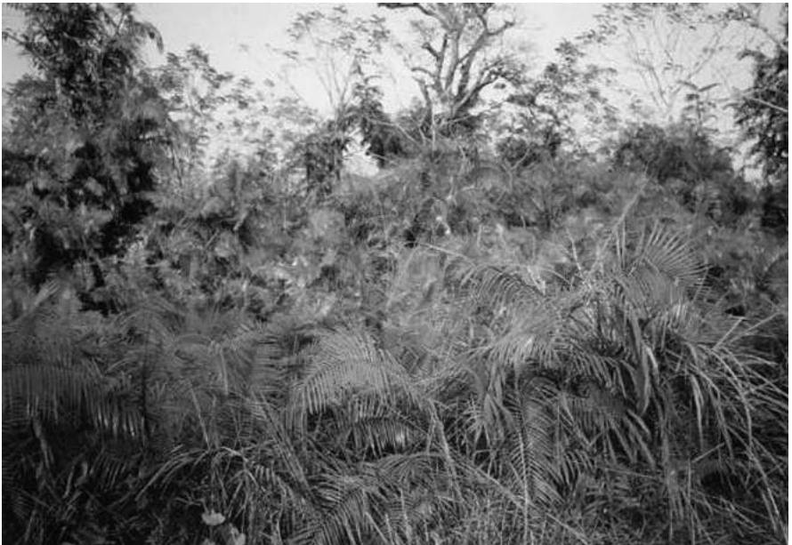
Figure 2. Community rattan forest.