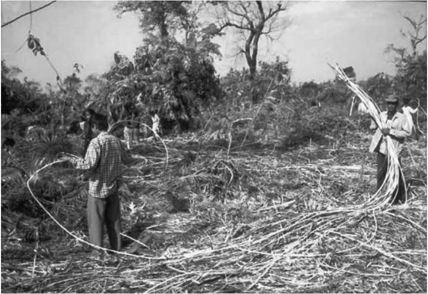
Figure 3. Community people busy with rattan harvesting.

Even after the forest was handed over to the community, they continued the previous system for the first few years until a training course on rattan management took place in 1997. With the support of experts, the community prepared a rattan management plan and divided the rattan forest into six blocks for 5 years rotational harvesting. One of the blocks was maintained for research and conservation purposes.